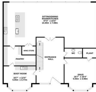
GROUND FLOOR 2013 sq.ft. (187.0 sq.m.) approx.