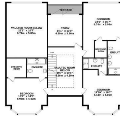
1ST FLOOR 1893 sq.ft. (175.9 sq.m.) approx.